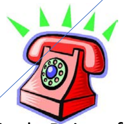
Single Point of Access

Local Activities: Drop In Cafes Sports Groups